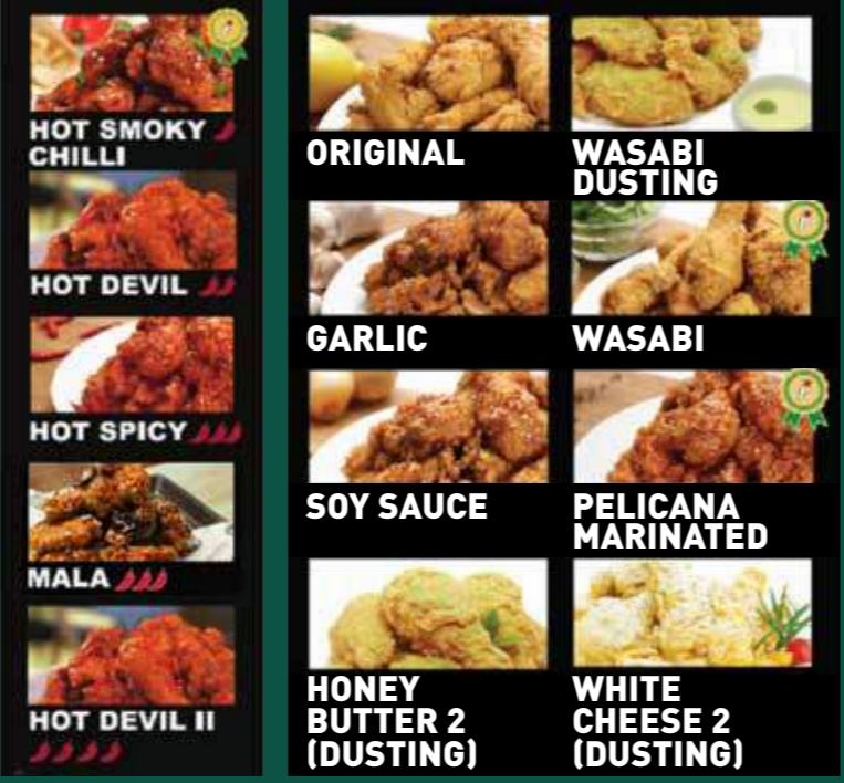
HOT SMOKY CHILLI